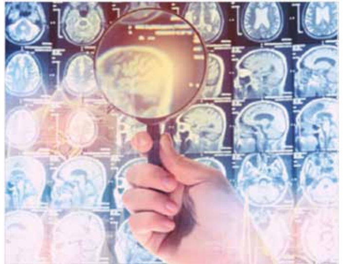
Graph 2: Analysing brain images

In order to enter clinical practice, the tool will be easy to use and